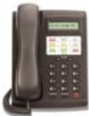
12-Key Digital Feature Phone