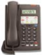
24-Key Digital Feature Phone

Select either the 24-Key Digital Feature Phone , complete with speakerphone and access to all available system features, or the 12-Key Feature Phone with limited access to system features. Each ESI phone includes an easy-to-read display for call handling information, plus fixed and programmable feature keys for simplified operation.